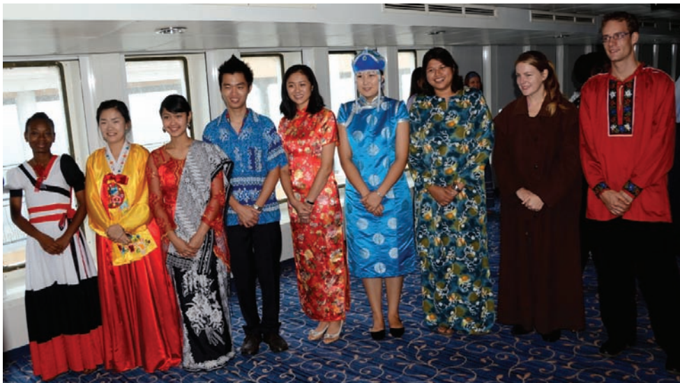
பலநாடுகளைச் சேர்ந்த தொண்டியர்கள் தங்கள் பாரம்பரிய உடையில்