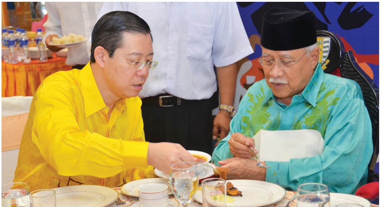
Chief Minister Lim Guan Eng serving satay to the TYT Governor at the Raya Open House.