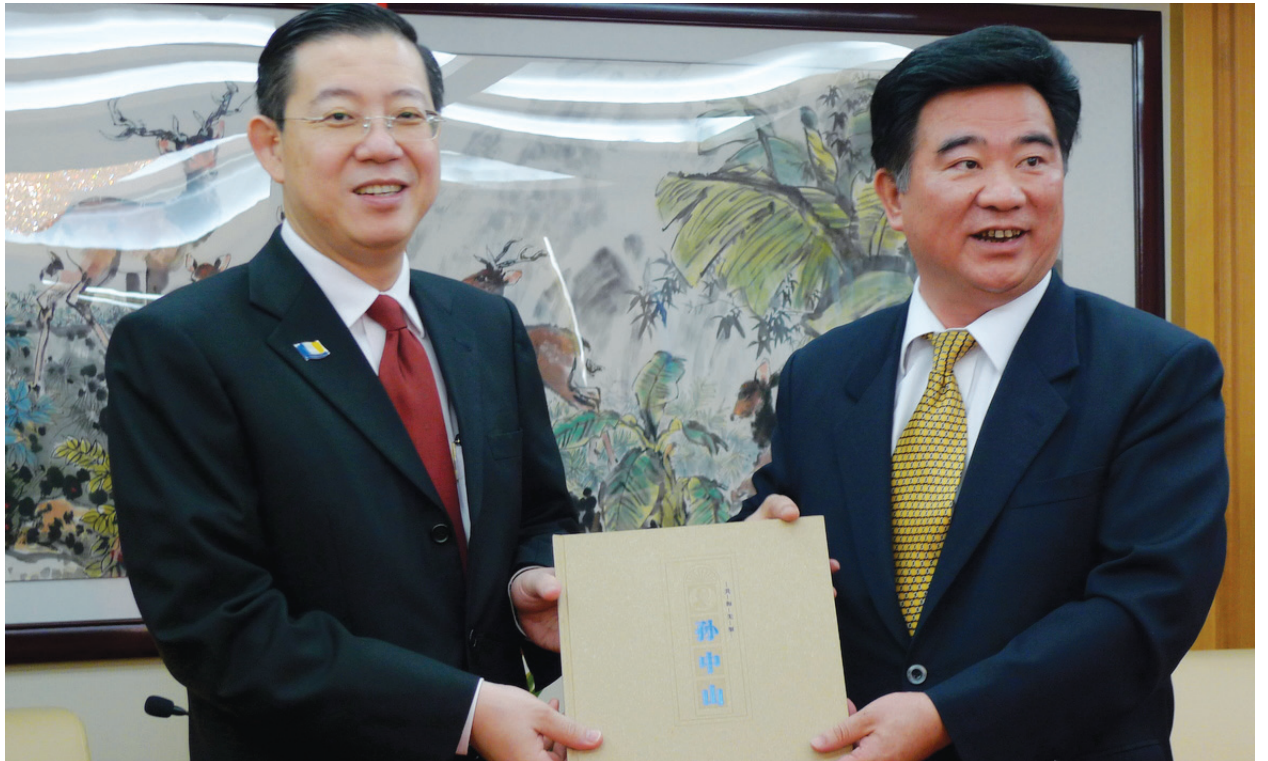
Chief Minister Lim Guan Eng and the Mayor of Zhongshan Mr. Chen Mao Hui.

Penang is indeed an ideal location that protects investments and serves as the perfect gateway to China through the Asean-China Free Trade Agreement. It is located at the hub of this trading relationship given that half of Malaysia's exports to and imports from China are in the electrical and electronics (E&E) sector of the economy. Intermediate as well as assembled E&E