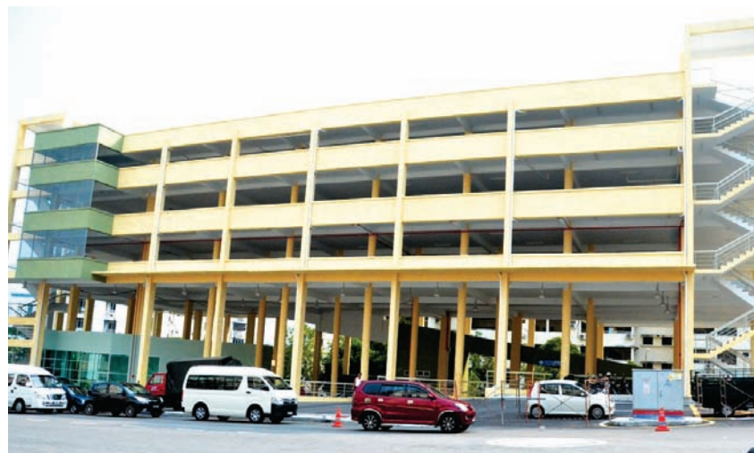
The controversial multi-storey carpark at the foothill of Penang Hill.

The project was first given to the JKR and MPPP to be carried out. However, during a state executive coun-