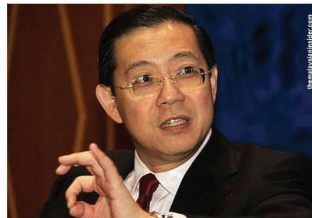
Using a racial special treatment economic policy in the state to create a more level-playing field that appeals to foreign investors.