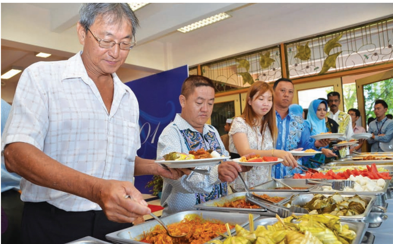
Visitors to the Penang State Hari Raya Open House helping themselves to delicious foods like satay, mee goreng, lemang, ais kacang and others.