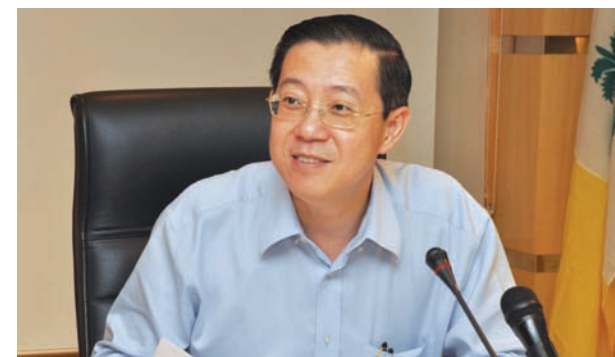
Chief Minister Lim Guan Eng

As troubles in the global economy threaten future foreign investments, Penang has prepared itself to take up the slack by commissioning RM8 billion worth of infrastructure works.