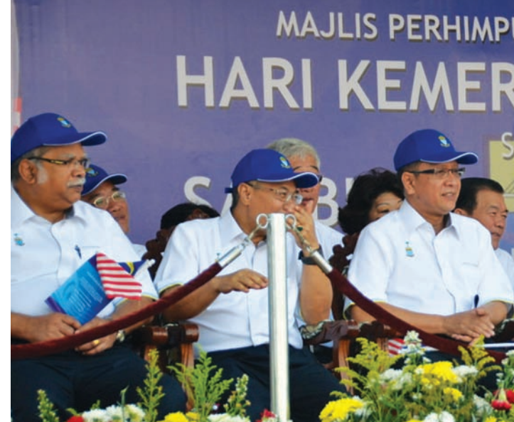
Penang State Leaders and the TYT Governor watching the Malaysia Day celebration.