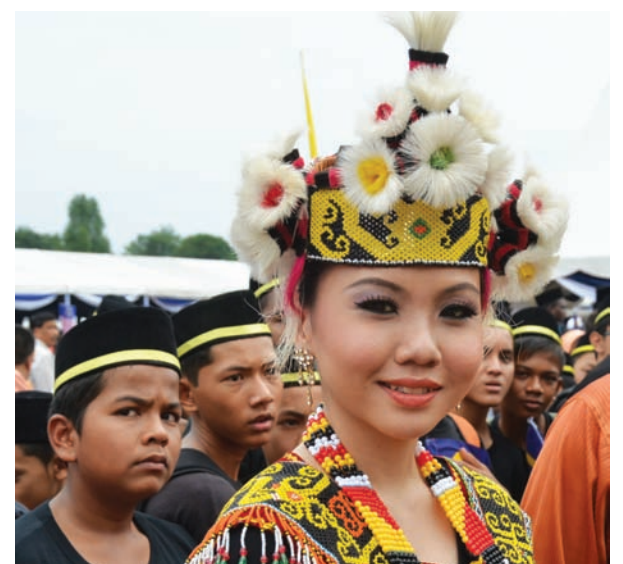
East Malaysian beauty spotted amongst the crowd.

By ensuring there is not only certainty but also clarity, we can enjoy prosperity together. The PR state government has