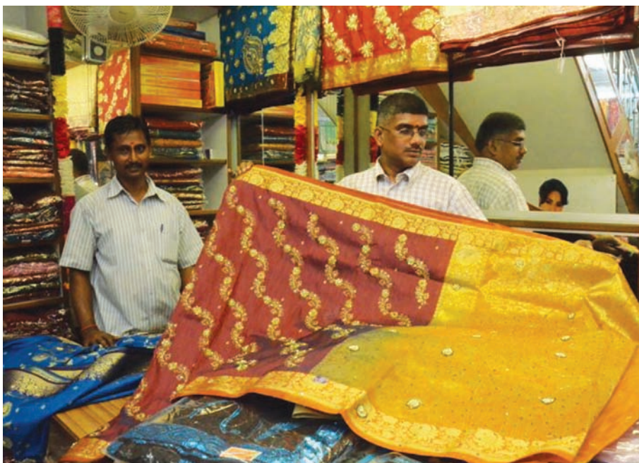
Deepavali is around the corner. Head over to Little India for the latest saree fashion.