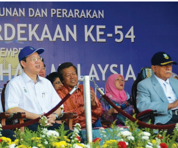
Malaysia Day parade at Padang MPSP in Butterworth.