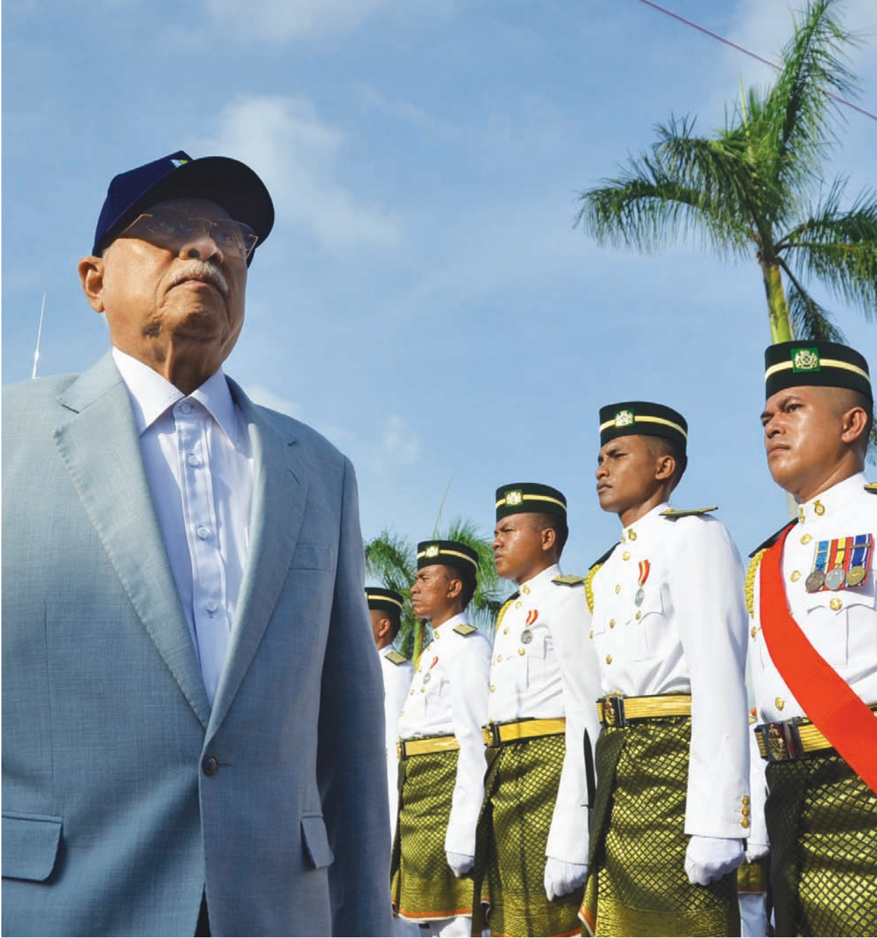
The Penang State Governor Tuan Yang Terutama Yang DiPertua Negeri Tun Dato Seri Utama Haji Abdul Rahman Bin Haji Abbas inspecting the guard of honour during the State Malaysia Day celebration.