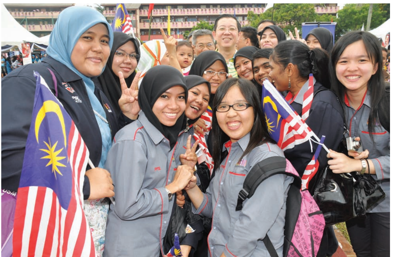
A group of students from USM taking a group photo at the Hari Raya Open House in Guar Perahu.