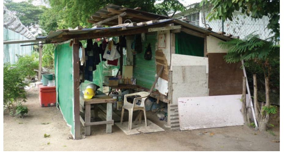
மனோகரன் தனது பேரனுடன் வாழ்ந்து வந்த ஆட்டுக்கொட்டகை