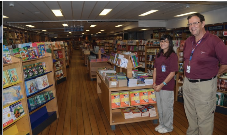
கப்பலில் உள்ள புத்தக நிலையம்

பணிபுரிகின்றனர். சிறுவர் முதல் பெரியவர்கள் வரையில் இந்தக் கப்பலில் இருக்கின்றனர். இவர்கள் ஒவ்வொருவரும் கப்பல் தொடர்ந்து பயணம் செய்வதற்குத் தங்களின் பங்கை ஆற்றி வருகின்றனர் பெரும்பான்மையோர் 2 வருட காலம் இக்கப்பலில் சேவை செய்கின்றனர்.