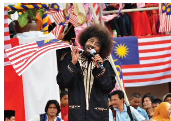
Famous singer Datuk David Arumugam of the band Alleycats entertained the crowd at the Merdeka and Raya Open House in Guar Perahu.