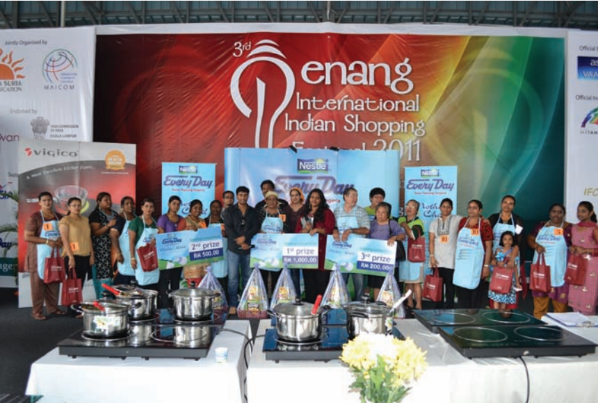
சமையல் போட்டியில் கலந்துகொண்ட பங்கேற்பாளர்கள்

அனைத்துலக இந்திய வர்த்தகப் பெருவிழா மூன்றாவது ஆண்டாகப் பிளாங்கு டைம்ஸ் ஸ்குவேர் பேரங்காடியில் நடைபெற்றது. கடந்த ஆகஸ்டு 12ஆம் தேதி தொடங்கி செப்டம்பர் 4 வரையில் நடைபெற்ற இந்த விழாவில் மக்கள் மடை திறந்த வெள்ளம்போல் திரளாகக் கலந்துகொண்டனர்.