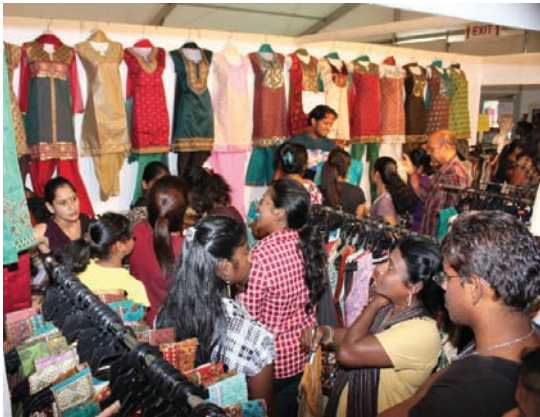
துணிமணிகள் வாங்கும் மக்கள்

இந்தியா, இந்தோனேசியா, பாகிஸ்தான் ஆகிய நாடுகளில் இருந்து மொத்த வியபாரிகள் பலர் இந்த வர்த்தகப் பெரு விழாவில் க ல ந் து கெ ரா ண் டு ன் . அ து ம ட் டு ம ல் ல ர து உள்நாட்டு வியபாரிகளும் இதில் கலந்துகொண்டது குறிப்பிடத்தக்கது. தலைநகரில் பத்தாண்டு காலமாக இனிப்புக் கடை