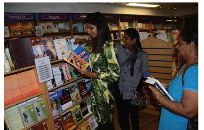
தமிழ்ப் புத்தகங்களை பார்வையிடும் மக்கள்

1970-இல் தனது பயணத்தைத் தொடங்கியதிலிருந்து 42 மில்லியனுக்கும் அதிகமானோர் இந்த மிதக்கும் புத்தக நிலையத்தை பார்வையிட்டுள்ளனர். குடும்பம், ஆன்மிகம் அரசியல், அறிவியல், விளையாட்டு, உணவு, கலை, மருத்துவம், மொழி, அகராதி, மனோதத்துவம் என 5000க்கும் அதிகமான தலைப்புகளைக்கொண்ட புத்தகங்களைச் சுமந்துகொண்டு இந்தக் கப்பல் உலகை வலம் வருகிறது. பல பதிப்பகங்களும் பழைய புத்தகங்களை இனாமாகக் கொடுத்து உதவுகின்றன. ஒவ்வொரு நாட்டிற்குச் செல்லும்போதும் அந்நாட்டு புத்தகங்கள் தங்களிடம் இருப்பதை லோகோஸ் ஹோப் உறுதிப்படுத்திக் கொள்கிறது. புத்தகங்கள் விற்பனைச் செய்வதைத் தவிர்த்து வளரும் நாடுகளில் உள்ள கல்லூரிகள், நூலகங்கள், பொது அமைப்புகள் என புத்தகங்களை இலவசமாகவும் வழங்குகின்றது. இத்தகைய சிறப்பு வாய்ந்த லோகோஸ் ஹோப் கடந்த ஆகஸ்டு 25 அன்று பினாங்கு துறைமுகத்தை வந்தடைந்தது. சுமார் ஒரு மாத காலம் (செப்டம்பர் 25 வரை) பினாங்கில் முகாமிட்டுள்ள இக்கப்பலில் சிறுவர் முதல் பெரியவர் வரை பெரும்பாலான பொதுமக்கள் திரளாக வந்து பார்வையிட்டுப் புத்தகங்கள் வாங்கிச் சென்றனர். உலகின் மிகப்பெரிய மிதக்கும் புத்தக நிலையத்தில் தமிழ்ப் புத்தகங்களும் இடம்பெற்றிருந்தது குறிப்பிடத்தக்கது.