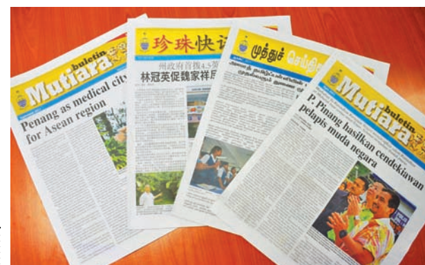
Buletin Mutiara comes in two separate issues. One is the Bahasa Malaysia version and the other English, Chinese and Tamil version.